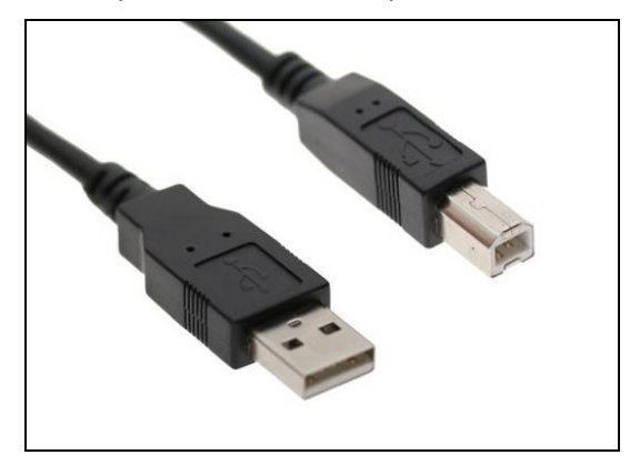
Figure 1: USB A/B cable for ACR38F-A1

The size is the same as a standard 3.5-inch floppy disk drive and there is no plastic cover on top. There are also screw holes on the reader for mounting the device on the computer chassis. For convenience, four (4) pieces of PA 2.6 mm \times 8 mm screws are included. A "4-pin mini power socket (M)" is provided on the PCB reader for the power interface (the socket is the same as the one used in a 3.5-inch floppy disk drive) on which the included USB A/B cable, shown in Figure 1 , is to be used for connecting the reader to a USB port on the host computer.