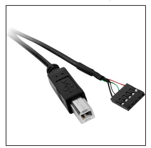
Figure 2: 1×5 pin header socket connector

Another option for the reader interface is the 1×5 pin header socket, where the cable shown in Figure 2 is to be used for connecting to the motherboard of the computer, instead of the USB cable.